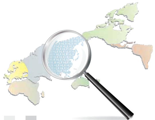
Global HLR coverage accessible through our API or Command Centre

With Number Discovery, a query will reveal real-time network information which enables you to route on the fly to the correct provider that: